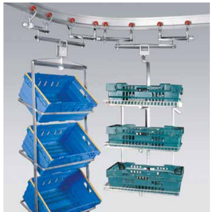
Transport suspension gear with four-fold moving gear