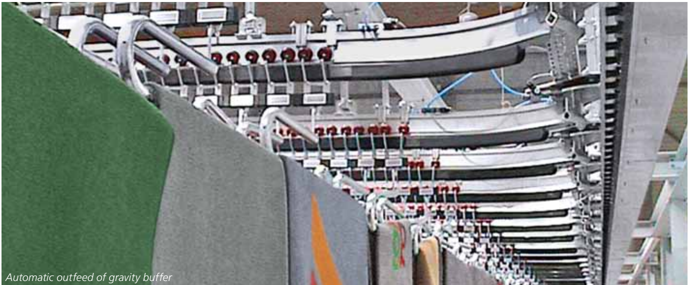
Automatic outfeed of gravity buffer

conveyor tracks, to various different levels in the building. In automated systems, trolleys are precisely transported, buffered and diverted. The entire distribution process is monitored by our selektron material flow control system.