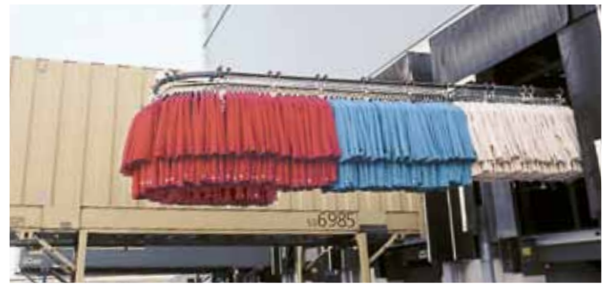
Loading boom for truck loading/unloading