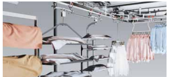
Transport suspension gear

Chain conveyors allow for reversible transport operations, i.e. trolleys can be moved in both directions, on the same