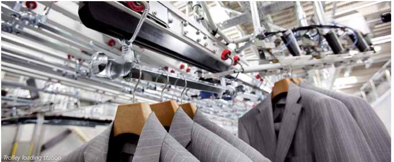
Trolley loading station

The GTT overhead trolley transport system allows for a fast transport of goods. The basic installation consists of tracks, switches, conveyors and trolleys. The system can be extended further, with a variety of components, depending on the specific requirements.