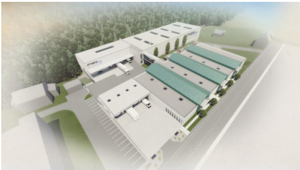
Overview after building extension Graphic Sport-Tec GmbH Physio & Fitness