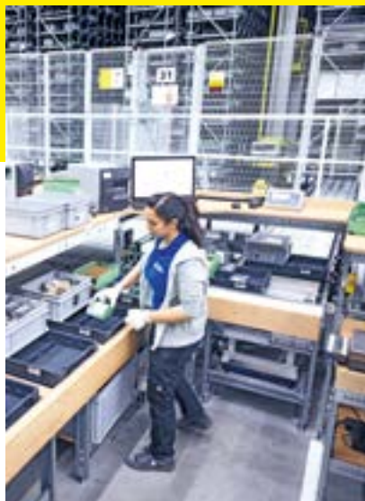
Order picking stations with parallel handling of up to 5 order bins (trays)