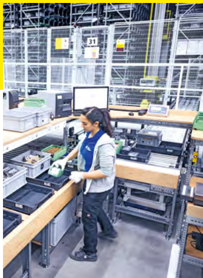
Order picking stations with parallel handling of up to 5 order bins (trays)